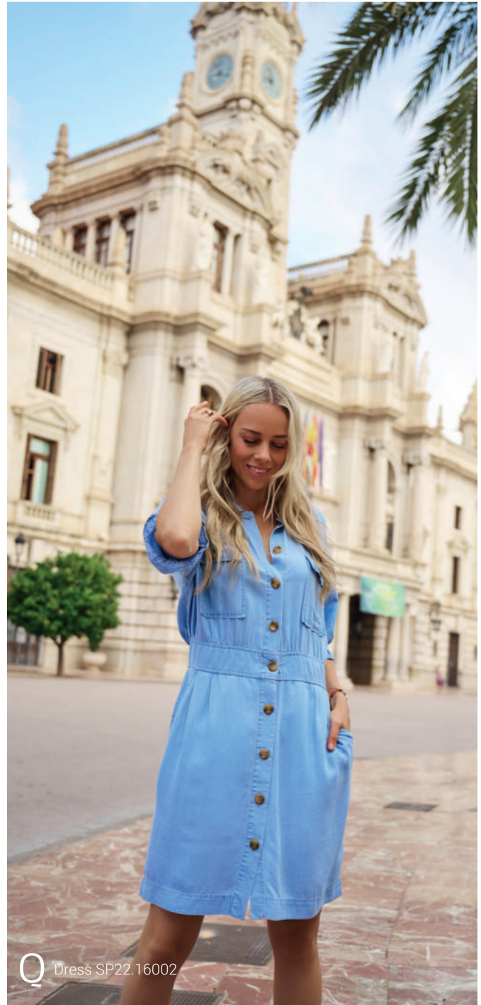
Q Dress SP22.16002