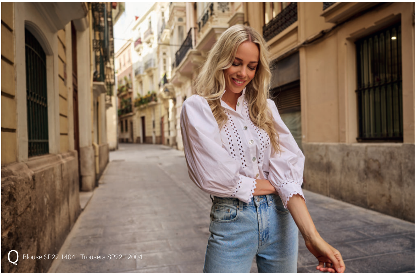
Q Blouse SP22.14041 Trousers SP22.12004