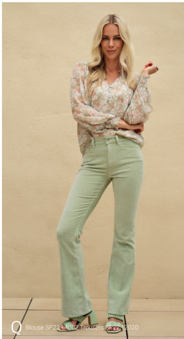
Q Blouse SP22.14002 Trousers SP22.12020