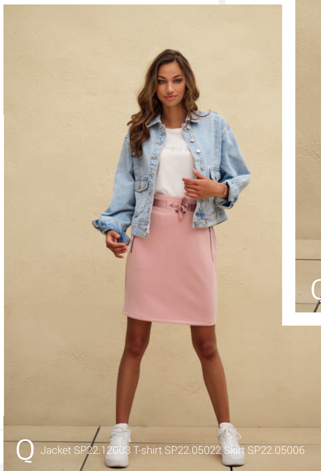
Q Jacket SP22.12003 T-shirt SP22.05022 Skirt SP22.05006

It's a perfect spot to watch the sun go down.