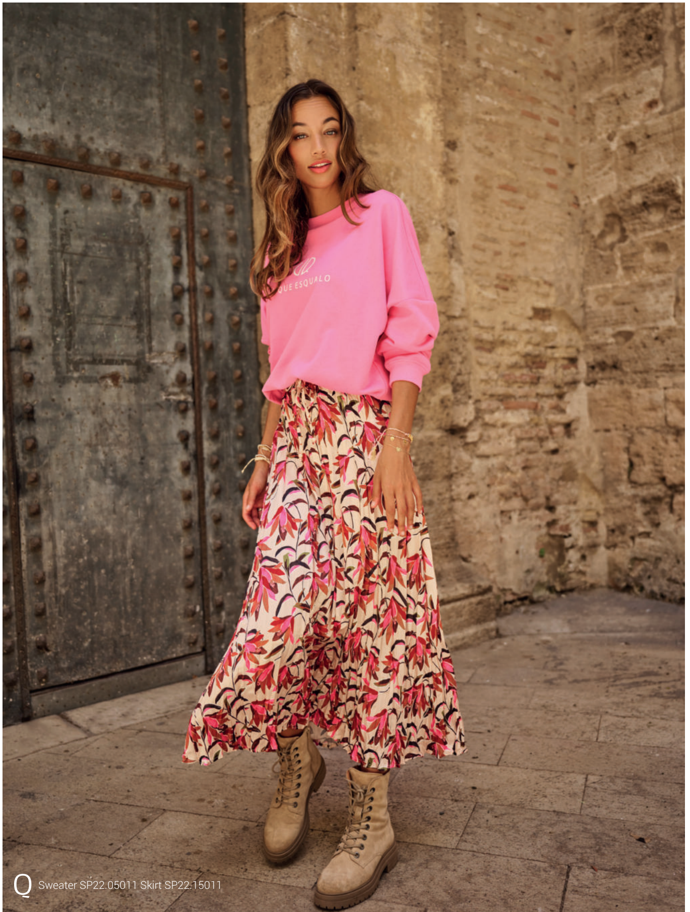
Q Sweater SP22.05011 Skirt SP22.15011