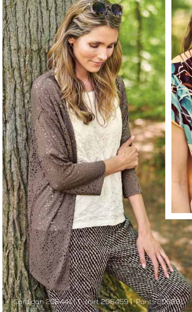
Cardigan 206441 | T-shirt 206459 | Pants 206281