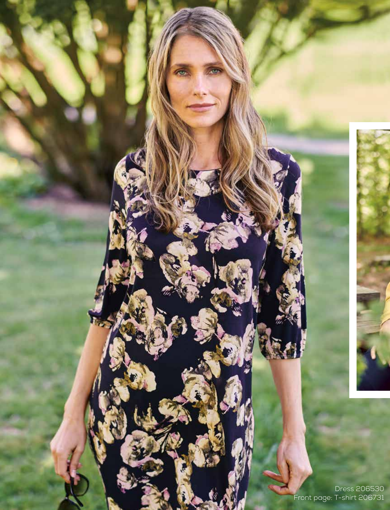
Dress 206530 Front page: T-shirt 206731